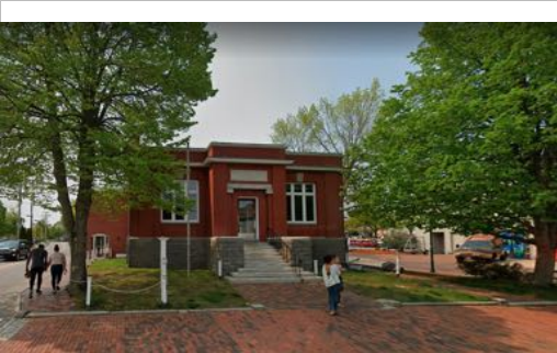
Bartol building